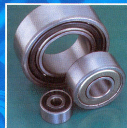
DOUBLE ROW BEARINGS