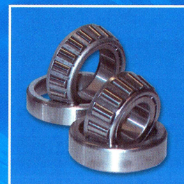
TAPERED ROLLER BEARINGS

AST Bearings are used extensively wherever precise rotation is necessary. In medical and dental equipment, packaging and mailing machines, automotive applications, construction, mining and agriculture equipment, power tools, electric motors, computer printers and disk drives, X-Y plotters, and many other applications too numerous to mention.