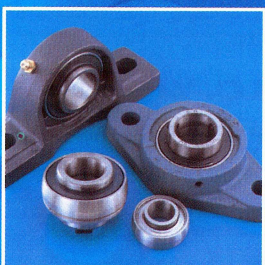
MOUNTED BEARINGS AND INSERTS