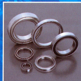
EXTRA THIN BEARINGS