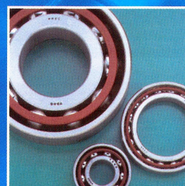
RADIAL AND ANGULAR CONTACT HIGH-SPEED SPINDLE BEARINGS

We offer world-class products and services, application expertise, failure analysis, custom re-lubrication, inventory-management programs, mechanical sub-assemblies and knowledgeable and responsive sales people.