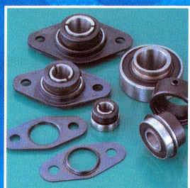
BUSINESS MACHINE LOCKING COLLAR AND FLANGETTE BEARINGS