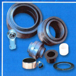
PLAIN BEARINGS: SPHERICALS, ROD ENDS, AND JU & JX BUSHINGS

We offer world-class products and services, application expertise, failure analysis, custom re-lubrication, inventory-management programs, mechanical sub-assemblies and knowledgeable and responsive sales people.