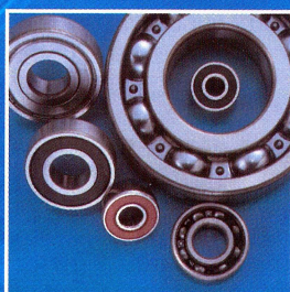
SINGLE ROW RADIAL BEARINGS