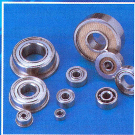
MINIATURE AND INSTRUMENT BEARINGS