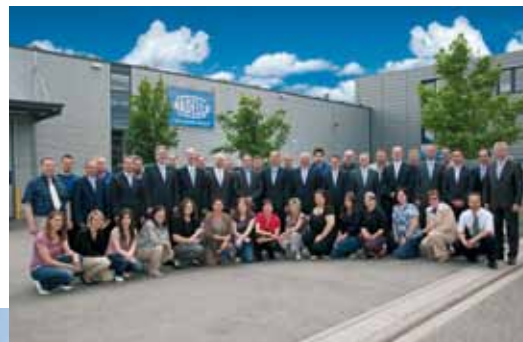
The team of Nadella