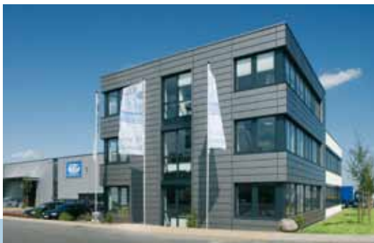
The new headquarters