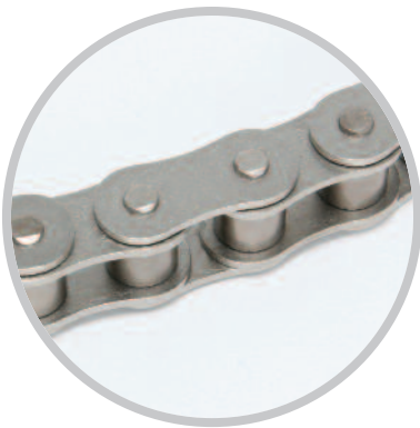
Nickel Plated Chain