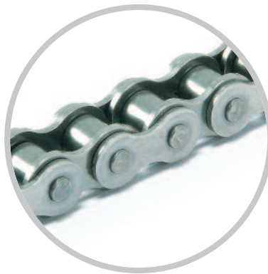
Stainless Steel Chain